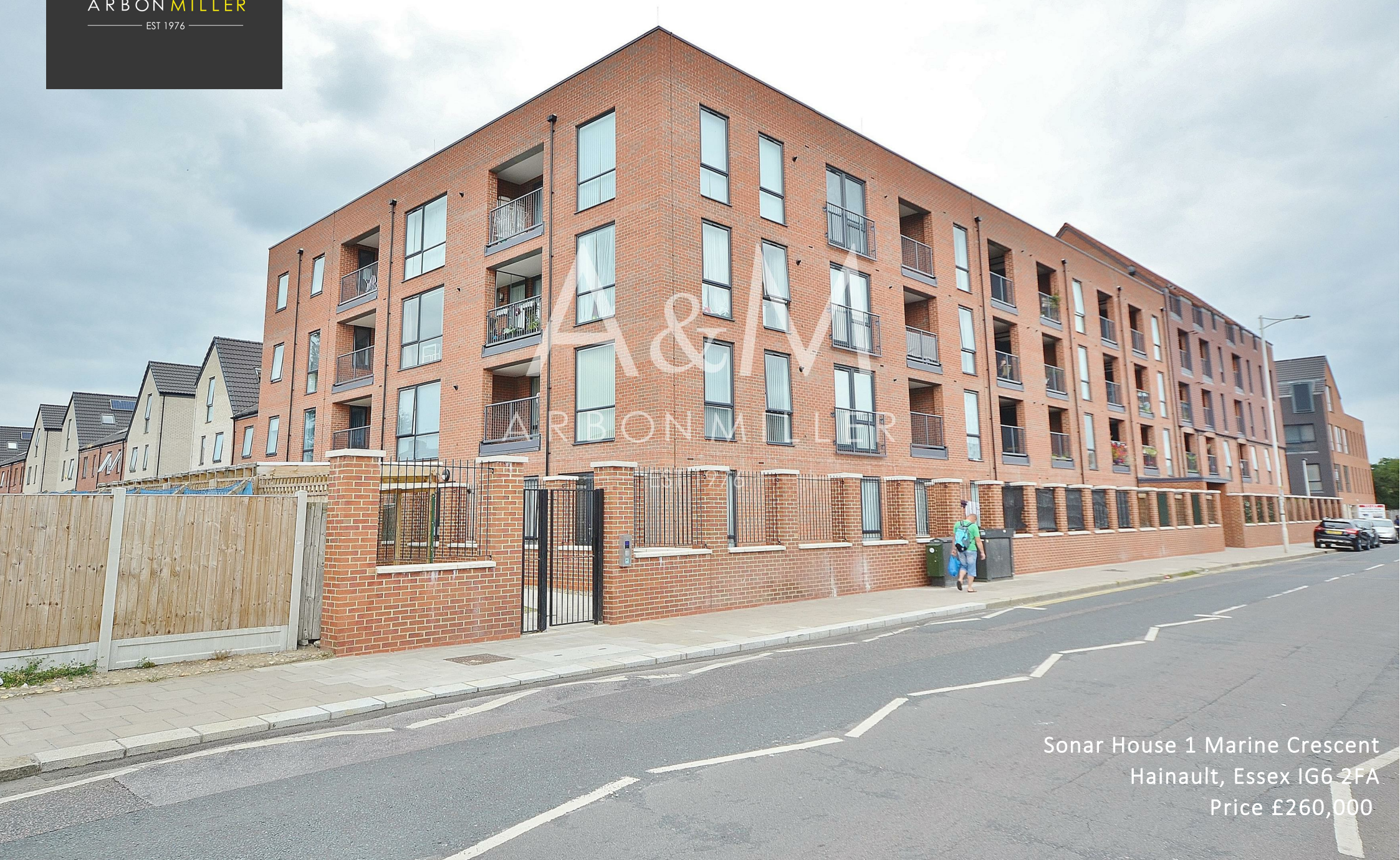
Sonar House 1 Marine Crescent Hainault, Essex IG6 2FA Price £260,000